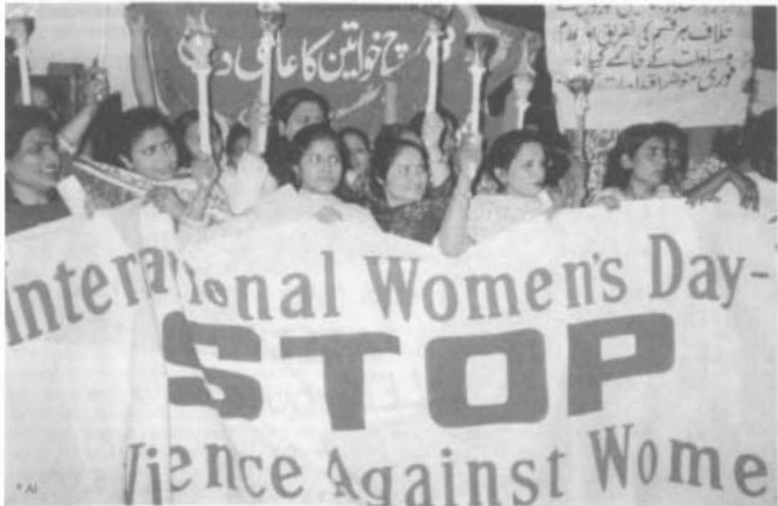
AI and other non-governmental organizations hold a rally in Pakistan to celebrate International Women's Day, 8 March 2001.

Poor and socially marginalized women are particularly at risk of torture and ill-treatment. In many cases, racist and sexist policies and practices