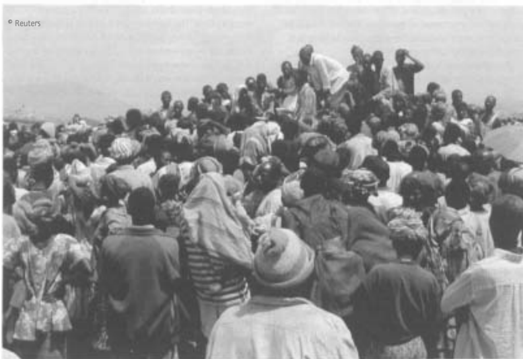
Refugees in Katkama camp, southeastern Guinea, queue to register for transfer to camps in safer areas, February 2001.

The scale of the refugee crisis in Africa is staggering. In the Democratic Republic of the Congo, where some 2.5 million people were believed to have died as a result of the fighting since 1998, deliberate reprisals against the civilian population remained a common reaction by all sides to military setbacks. By the end of 2001 as many as two million civilians were internally displaced, unable to support themselves and out of reach of humanitarian