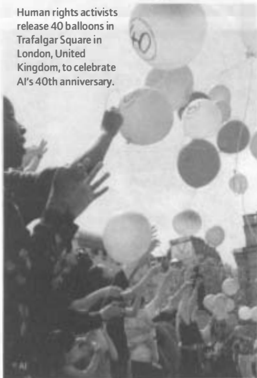
Human rights activists release 40 balloons in Trafalgar Square in London, United Kingdom, to celebrate AI's 40th anniversary.

"Forty years on, Amnesty International has secured many victories. Its files are full of letters from former prisoners of conscience or torture victims thanking the organization for making a difference. Torture is now banned by international agreement. Every year more countries reject the death penalty. The world will soon have an International Criminal Court that will be able to ensure that those accused of the worst crimes in the world will face justice. The Court's very existence will deter some crimes.