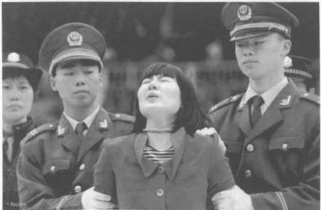
A woman shouts as she hears the verdict before she is taken to be executed in Ghangzhou, China, in April 2001.