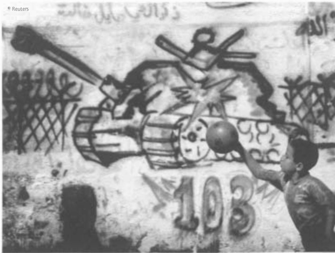
A Palestinian boy plays by a wall sprayed with graffiti in Khan Yunis, Gaza Strip, April 2001. Since the latest intifada began in September 2000, violence has become a part of daily life in Israel and the Occupied Territories.