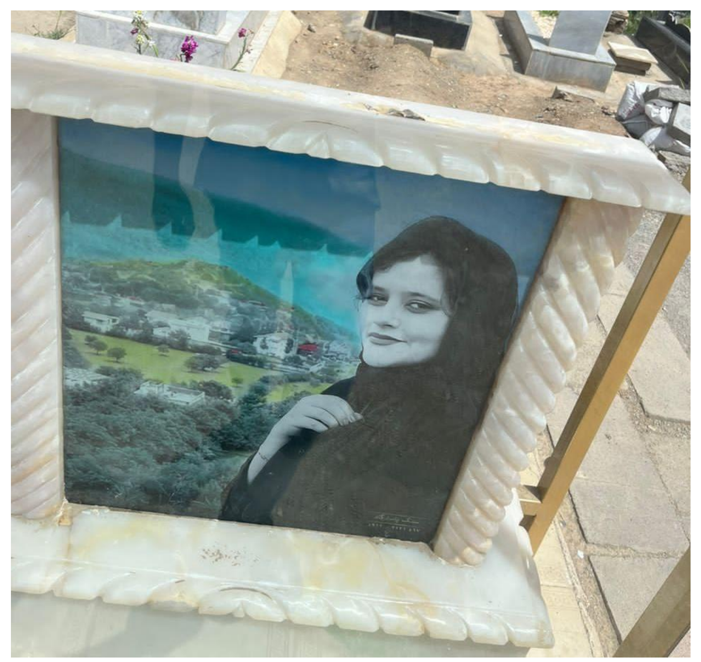
A picture of Mahsa/Zhina Amini's grave after it was vandalised for the second time, on 23 May 2023, this time with the crown on the headstone broken off and removed.