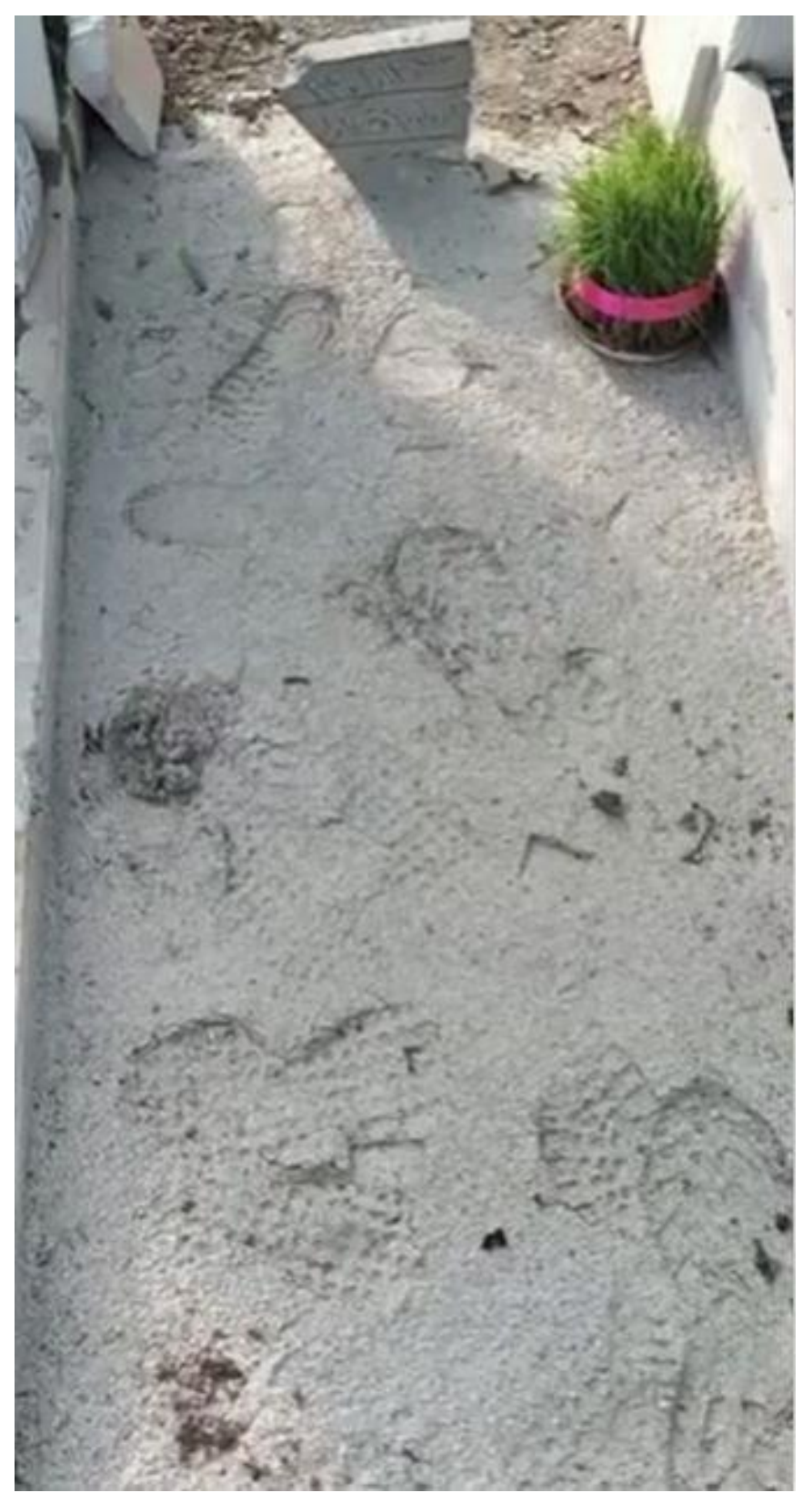
Arian Khoshgavar've grave. The picture shows his grave after it was vandalised with the cement containing multiple shoe prints