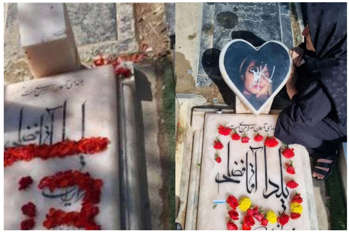
Yalda Aghafazli's gravesite. The picture on the left is from April 2023, when the heart-shaped part of her headstone containing a picture of her face was removed. The picture shows the pillar that remained afterwards. The family reinstalled a heart-shaped headstone several days later. The picture on the right is from August 2023 when lines were scratched onto her face on her headstone.