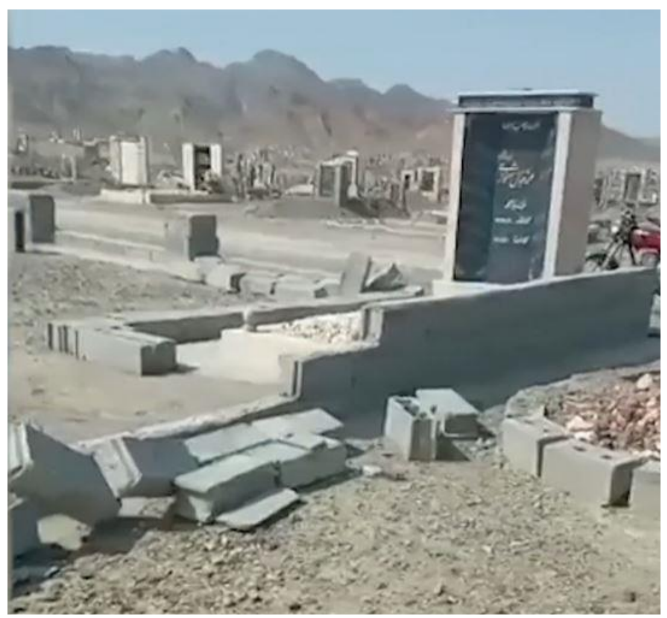
The grave of Mohammad Eghbal Shahnavazi (Nayebzehi). The picture shows his gravesite after it was vandalised, with some of the bricks forming the raised concrete structure around his grave broken.