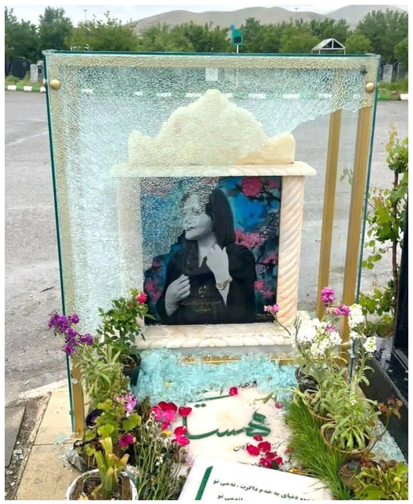
A picture of the vandalised grave of Mahsa/Zhina Amini, taken on 21 May 2023, with the glass encasing the headstone broken.