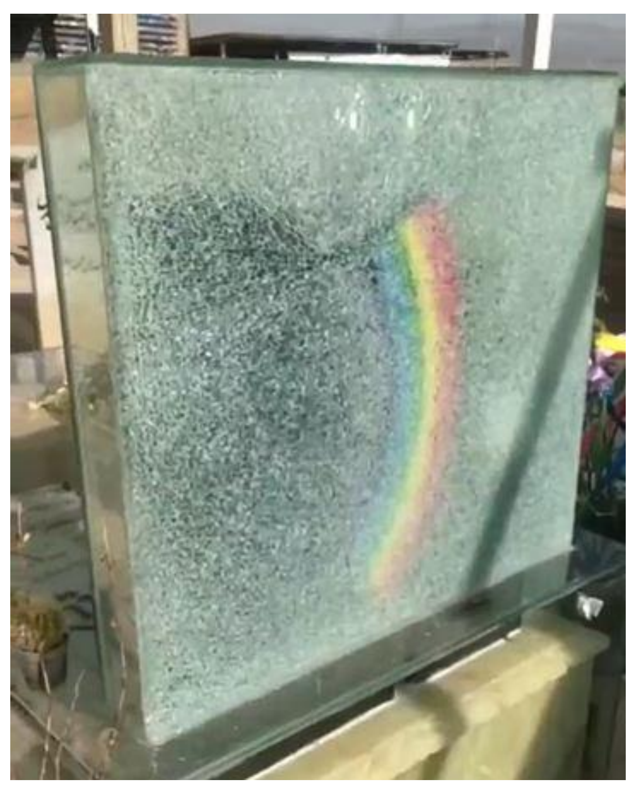
Kian Pirfalak's vandalised grave. The picture is a still from a video taken of his grave which showed that the glass encasing his headstone had been smashed.