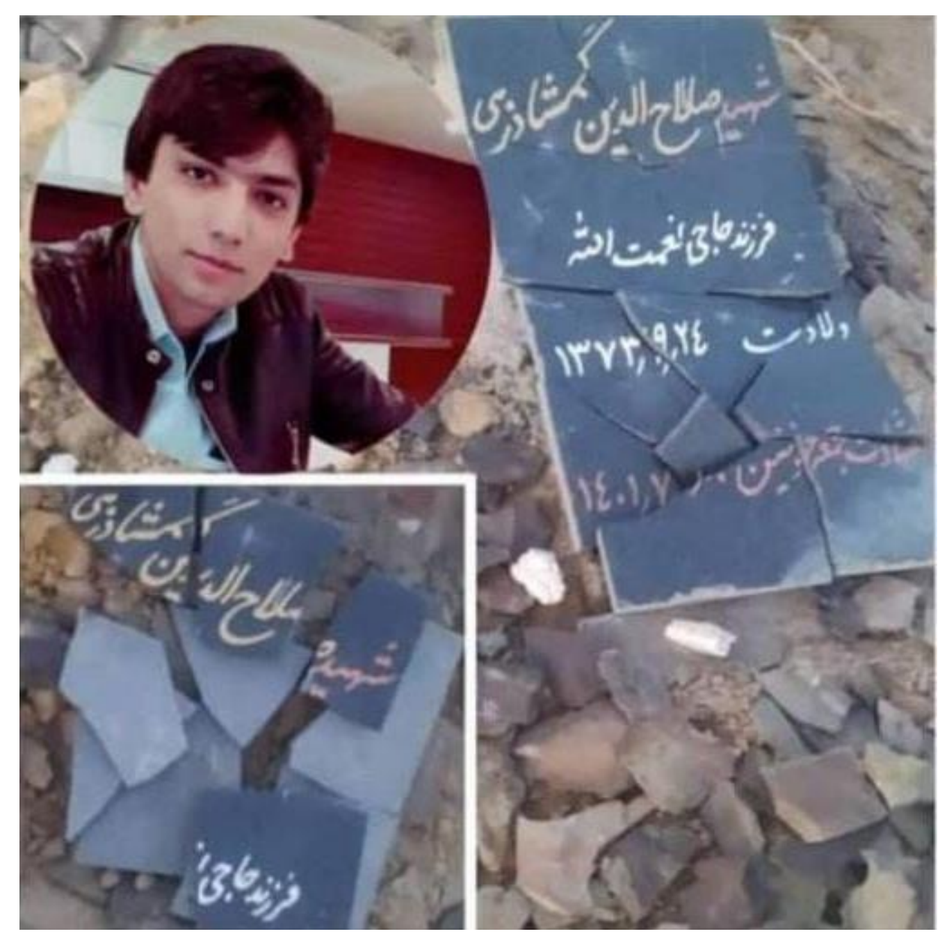
Salaheddin Gamshadzehi's grave. The picture shows his gravestone smashed into pieces.