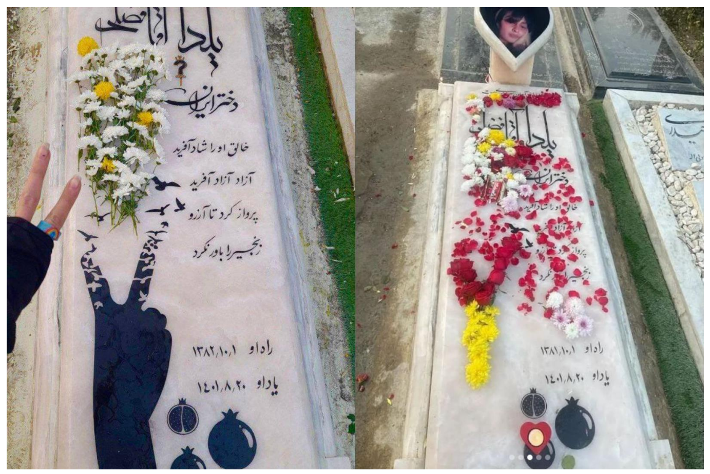
Yalda Aghafazli's grave. The picture on the left shows her gravestone including the artwork depicting the victory sign with two raised fingers that transform into numerous flying doves, before it was vandalised. The picture on the right shows her grave after the artwork was erased.